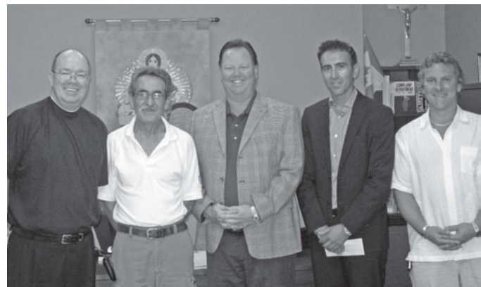
Some of the lucky winners of the Good Shepherd Dream Lottery