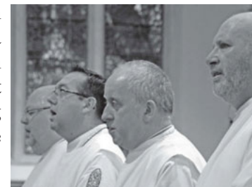
50th celebratory mass in Hamilton