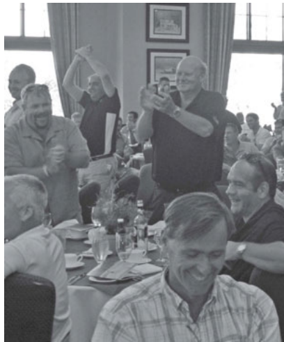
Guests enjoying the evening's festivities

The 2011 tournament and lottery was a tremendous success. Thank you to event sponsors, the organizing committee, golfers, donors and our volunteers.