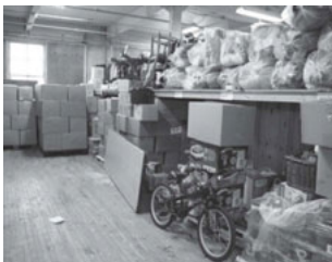
Container being prepared for Haiti.

Since the earthquake in Haiti, the Brothers have been working very hard to ensure that the orphanage and school were rebuilt. In June there was a cholera outbreak in Haiti and we were concerned and kept a vigilant watch on all the children as we had some children in hospital who were very sick.