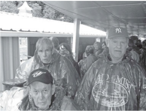
Residents of St. Joseph's enjoy the Maid of the Mist

This summer has been very busy at Barrett House and St. Joseph's Residence. We have had one new resident move in to Barrett House and landscaping has been completed which will enhance the garden next year when it will bloom with perennials. Plans are in the works this fall to continue with physical improvements to Barrett House.